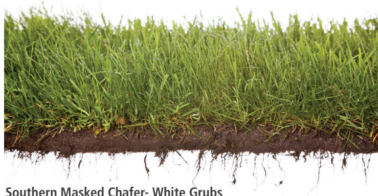
Southern Masked Chafer- White Grubs ( Cyclocephala lurida )